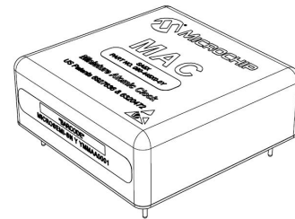
Figure 2: Microchip Rubidium based Miniature Atomic Clock used in Stratum 1 SyncServers for extended holdover can fit in the palm of your hand.

For reliability, these NTP servers also employ stable internal oscillators in case the server loses the satellite signal and goes into holdover. Oscillator holdover accuracy varies based on the type of oscillator: from 400 microseconds over the first 24 hours of signal loss for a standard quartz oscillator to less than 1 microsecond for an inexpensive rubidium atomic oscillator.